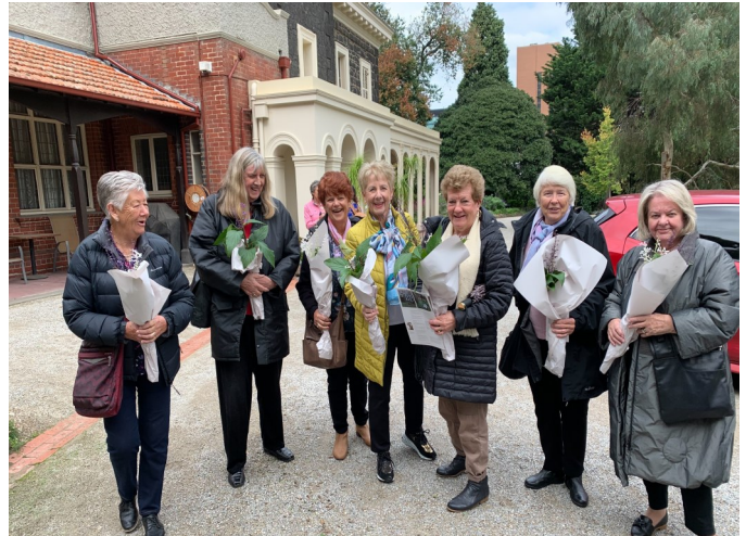
Brides of Bishops court?